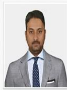
Business Development Manager - Asia SOTAX India